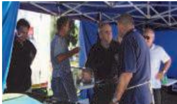
The Catering crew in discussion