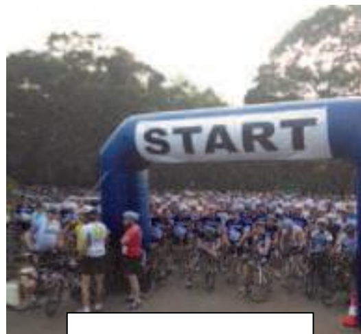
Bike ride start at Loftus