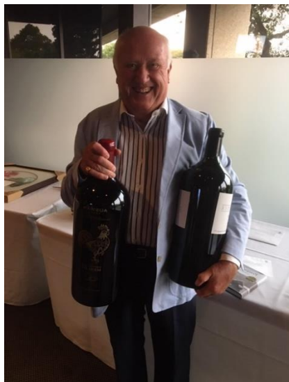
6 litre bottles of Merlot as raffle prizes