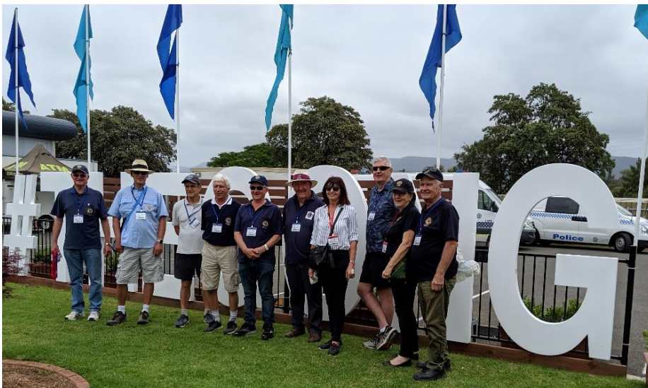
The great Gong Team,